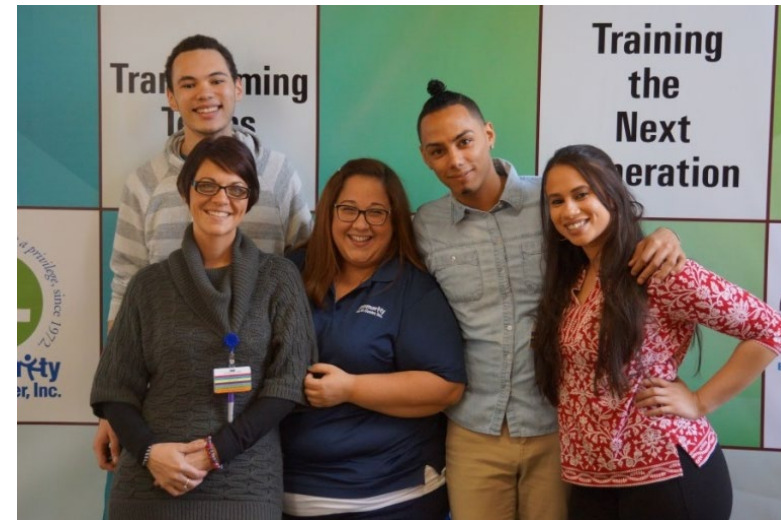
CHC/NIMAA Inaugural Medial Assistants